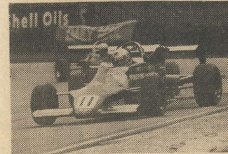
DAVIES: popular in Wales!