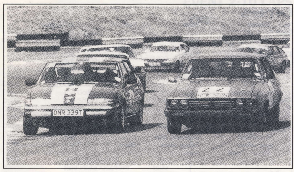
Rovers and Capris contest Class A of the ever-popular Slick 50 Road Saloon Car Championship.

The intermarque race is exclusively for Italian cars and to allow them to compete on an equal footing there can be as many as eight classes.