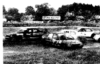
EUROCAR mix up.

Eurocar championship, race five - 15 laps: 1 Steve Dance 16m 10.65s (63.89mph); 2 Willis; 3 Jason Hunn; 4 Mark Loveland; 5 Beeston; 6 Paxman. Fastest lap: Peter Falding 1m 03.26s (65.44mph)